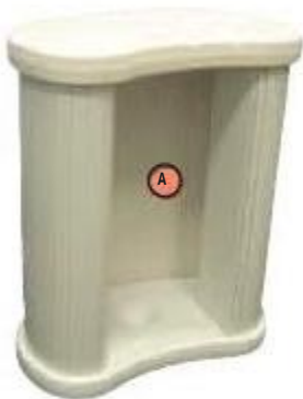
Kneehole style counter

The end of the tambour wrap can slot into groove A for a knee hole open style counter or groove B for full wrap style counter.