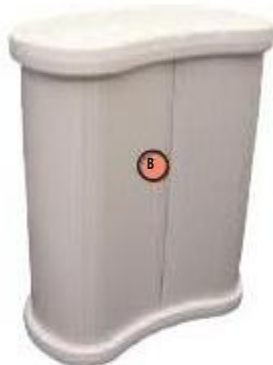
Full wrap style counter